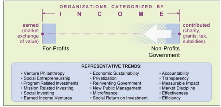
Figure 2. Blurring Boundaries of the Public and Social Sectors