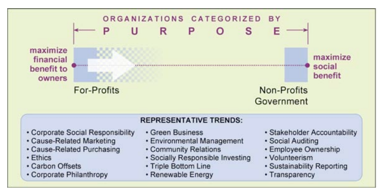
Figure 1. Blurring Boundaries of the Private Sector

At the same time, some governmental and non-profit organizations have become more businesslike, adopting earned-income strategies and a market orientation. Social Entrepreneurship, Mission Related Investing, Municipal Enterprises, and Privatization are examples of these trends (see Figure 2).