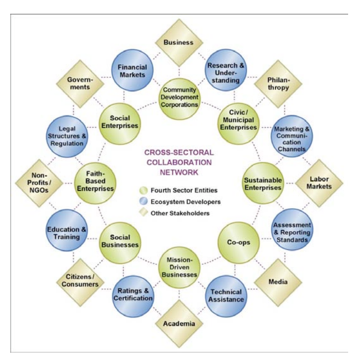
Figure 4. Cross-Sectoral Networks for Collaboration to Accelerate Ecosystem Development

The Fourth Sector is a sprawling, unruly, robust emergent. It is geographically dispersed and conceptually unsettled, with lots of moving parts. It spans across multiple disciplines, industries, and organizational cultures, and at some level, it touches the lives of most people on the planet.